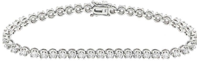
SD25845B 18K - 7.89g Dia 2.5mm (2.35ct)